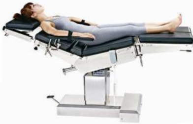
Head and Neck