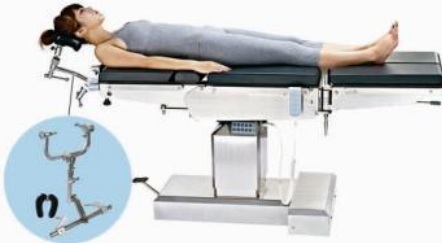
Eyes and Prosthetics