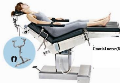
Cranial nerve(Sitting posture)